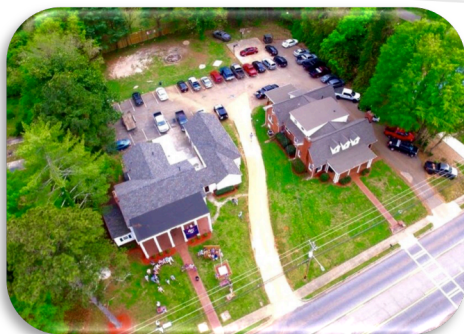
The Chi Phi Off-Campus Compound @ UWG

History: Founded in 1824 at Princeton University, Chi Phi is the oldest men's social fraternity in the United States. The Chapter at UWG was founded in 1972, which makes it one of the most established fraternities at West Georgia. With over 850 active Alumni (over 150 living in the Carrollton area), the Chapter possesses the most active alumni association by far among UWG's many fraternal organizations. Chi Phi has owned and occupied our Chapter House on Maple Street since 1972. Over the years our Alumni have purchased two